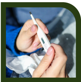
High Fever (e.g., 103°F)

Symptoms can reoccur and produce a telltale pattern of fever lasting roughly 3 days, followed by 7 days without fever, followed by another 3 days of fever.